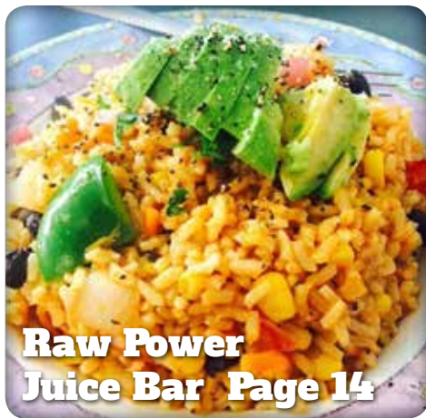
Raw Power Juice Bar Page 14