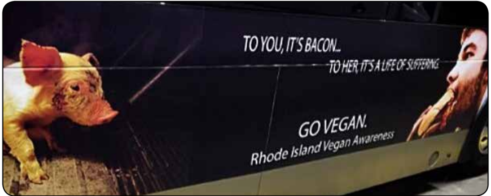
RIVA 2016 (below) and 2017 (above) Bus Campaigns RIVA Community Outreach (left)