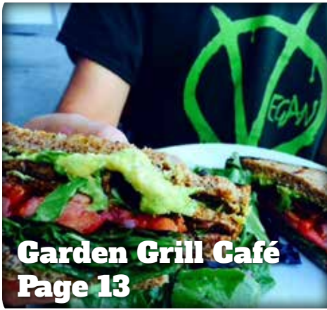
Garden Grill Café Page 13