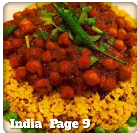
India Page 9