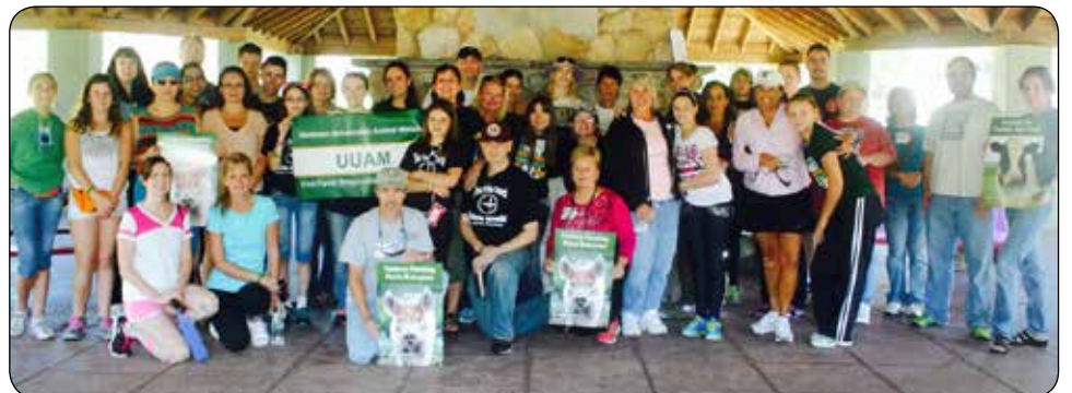
RIVA Summer Fundraiser