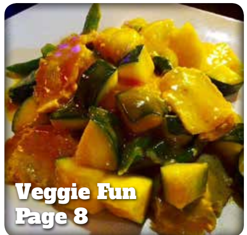
Veggie Fun Page 8