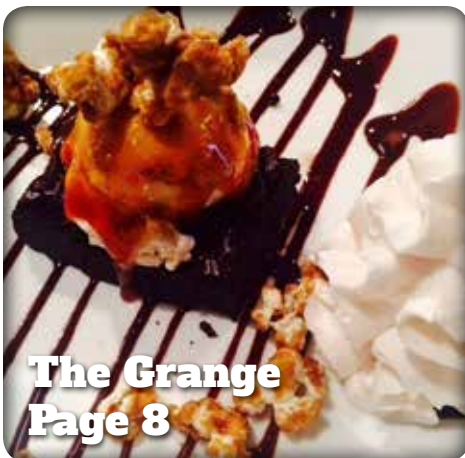
The Grange Page 8