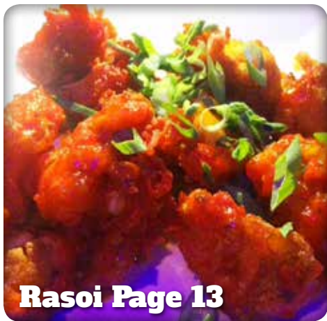
Rasoï Page 13