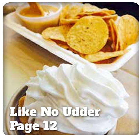
Like No Udder Page 12