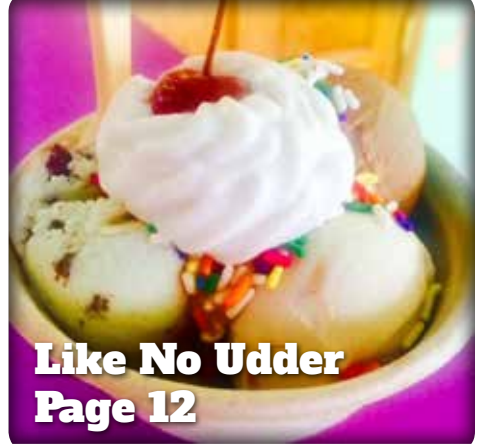
Like No Udder Page 12